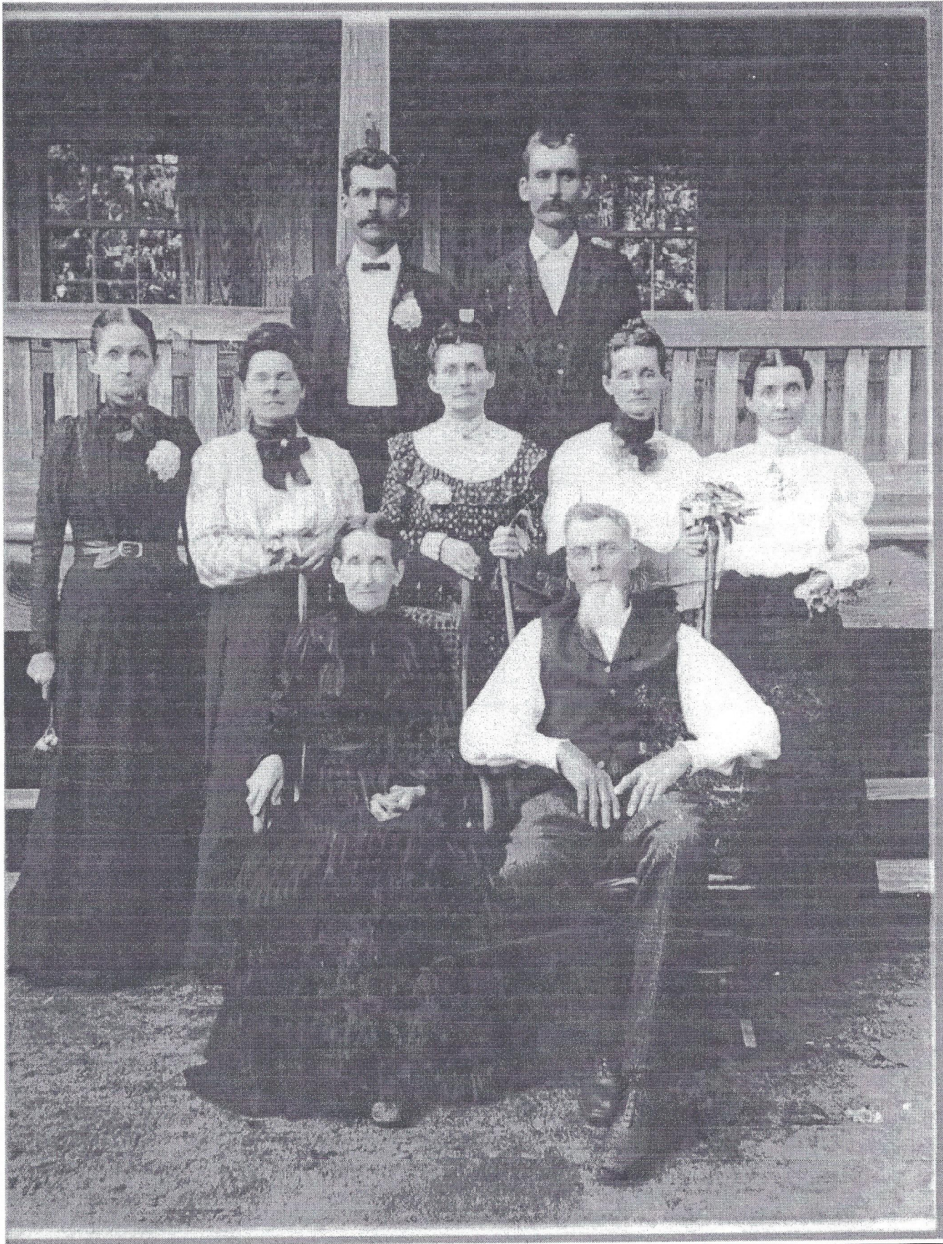
The Arnwine Family, 1905, Jacksonville, Texas