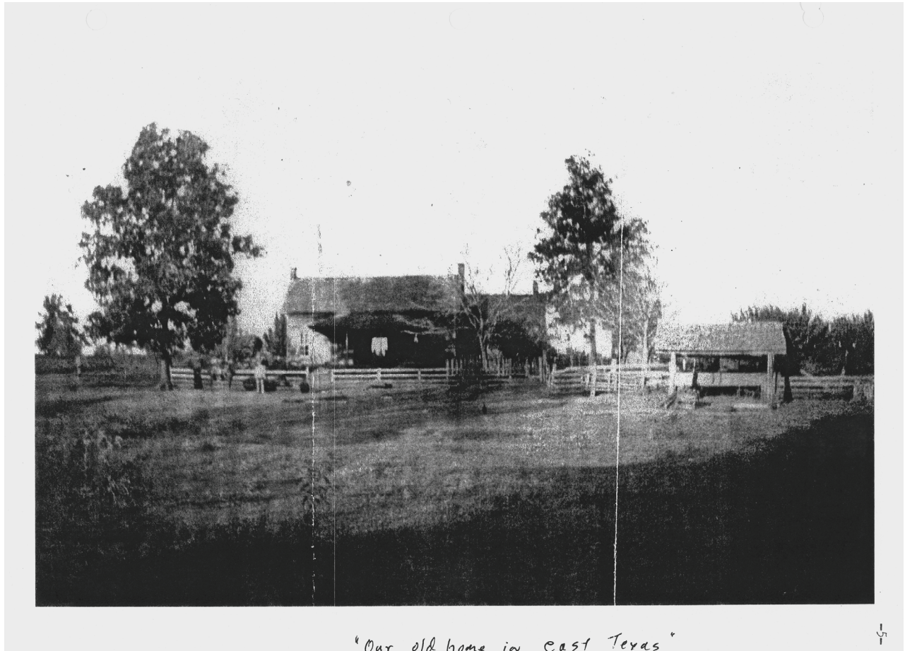
"Our old home in east Texas"