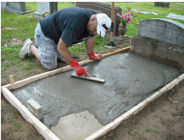
Troweling the concrete