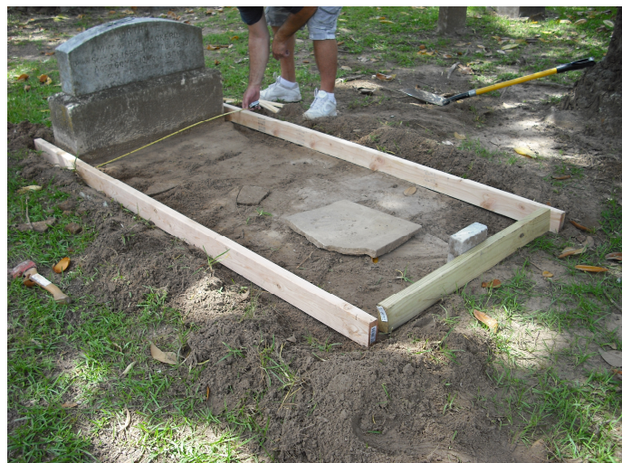
Measuring the framing the new concrete slab