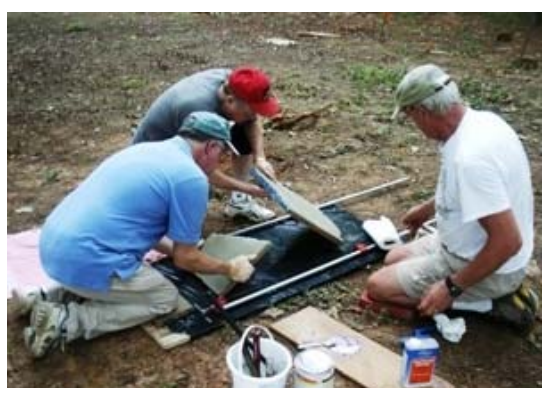
After the broken edges have been cleaned, the pieces are carefully aligned face up on the work surface.

4. Before using epoxy, read the manufacturer's instructions completely. With plastic gloves, open the cans of 2-part epoxy