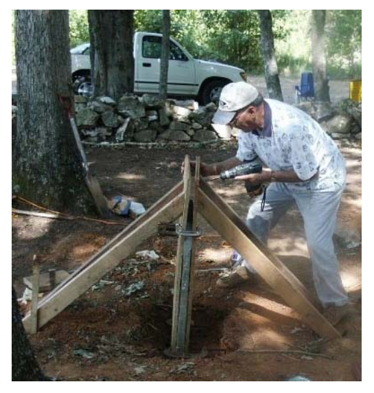
Encased between sheets of plywood and braced by 2x4s, the tombstone cures for several days before soil is packed around the base.

9. Leave the tombstone for at least two days or more to cure. Remove the C-clamps, supports, and plywood. Fill in the soil around the base of the tombstone.