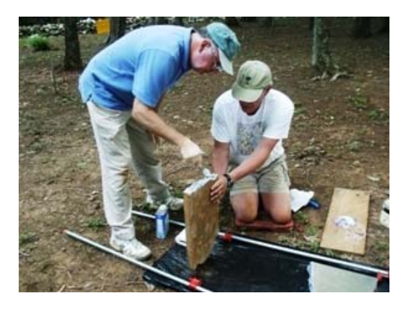
Epoxy is applied quickly to each end of the broken pieces.

plywood. Lightly cover the entire surface of the edges with the epoxy, but do not put too much on the stone. Experience helps at this point. It is very easy to put on too much epoxy. Depending on the temperature (the hotter it is, the faster the epoxy dries), the epoxy will start hardening in about 15 minutes. Work carefully and quickly.