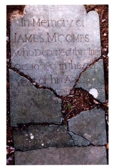
BEFORE—Tombstone broken in pieces and one piece missing.

3. right side of the tombstone to create a frame for the missing piece. With the tombstone face up, fill the hole with Patcher. Follow the directions on the container to mix this product. Patcher sets up in about five minutes, so mix only the amount you can use quickly. Fill the hole only to the level of the surrounding pieces. Use water and a