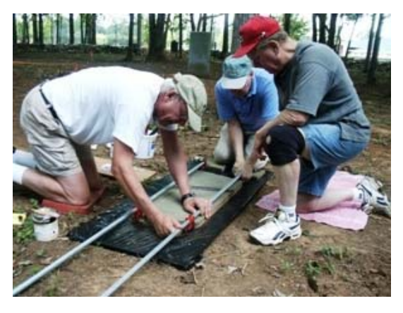
Long pipe clamps are placed on each side of the tombstone and tightened slowly.

6. Place the two pieces of the tombstone together, using one long, pipe clamp lengthwise (top to bottom) on the right side and another clamp on the left side. Use furring strips when possible between the tombstone and the clamps to protect the stone and to give it a stronger connection. Make sure the two pieces of the tombstone