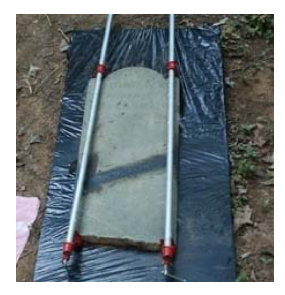
Clamped tightly, the pieces are allowed to dry for several days.