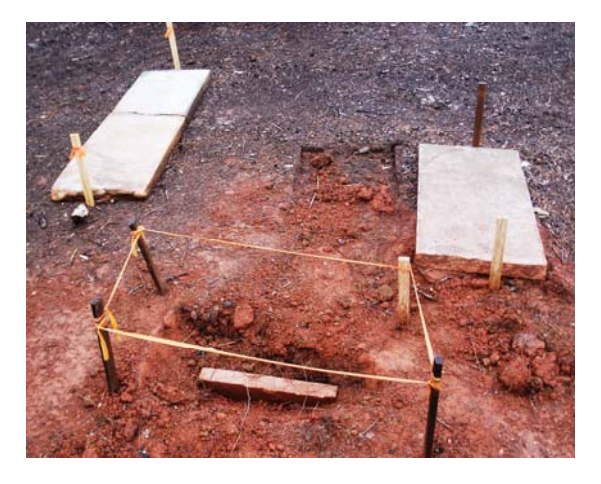
The base (cordoned off) for the tombstone on the right was found six inches below ground.